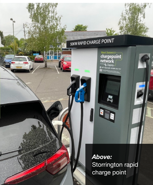
Above: Storrington rapid charge point

For more information on what Neighbourhood Wardens do in our local communities, please visit www.horsham.gov.uk/community/neighbourhood-wardens .