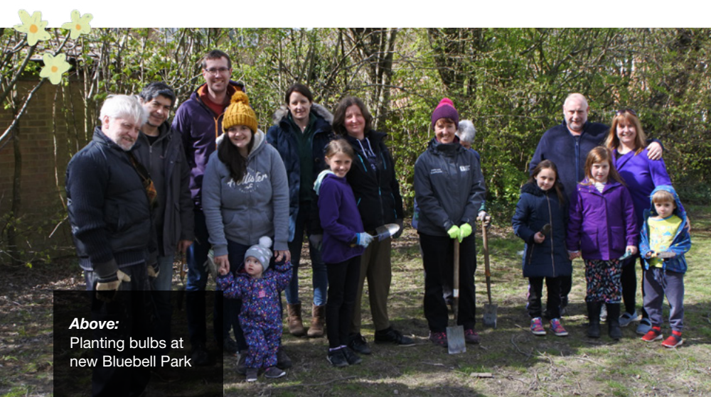
Above: Planting bulbs at new Bluebell Park

The annual Bees' Needs Awards took place online in November 2021.