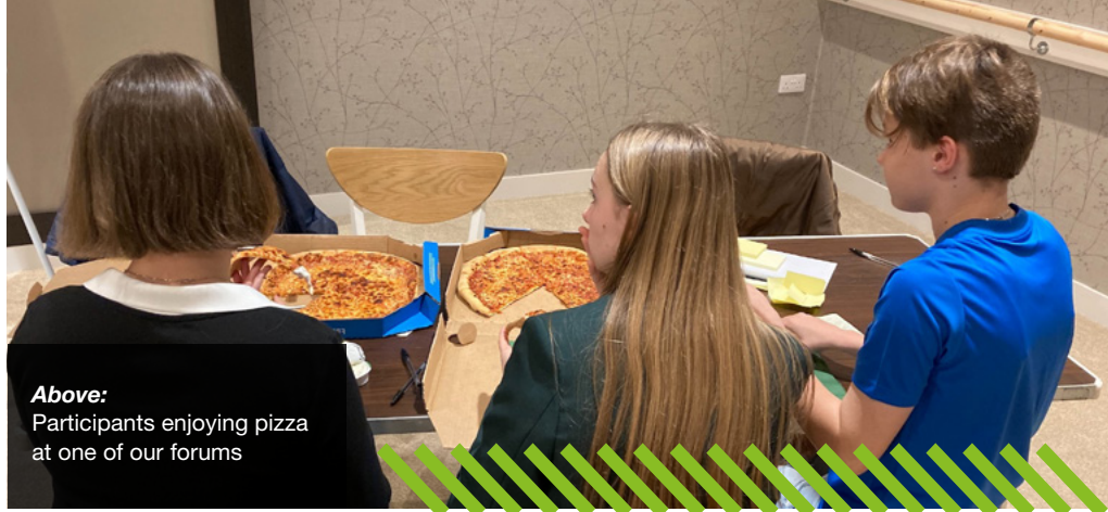
Above: Participants enjoying pizza at one of our forums

Our Community Development team have recently developed the Horsham District Youth Forum with the aim of bringing young people aged 11 to 18 together to discuss topics which are important to them.