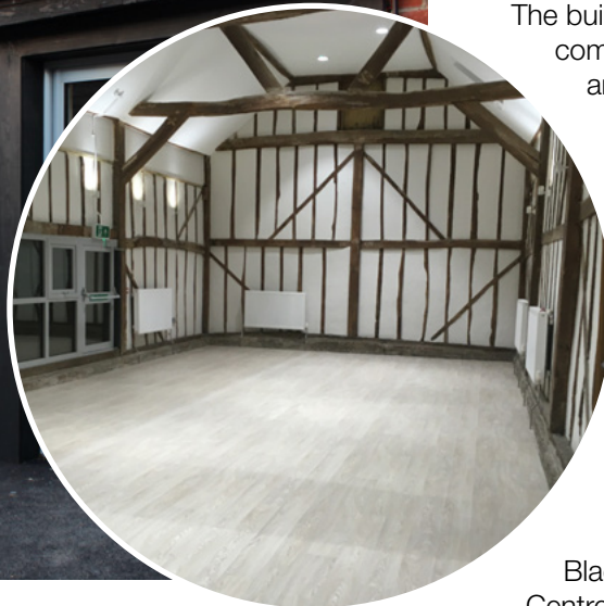
Right: Blackbridge Community Centre's Main Hall with new LED lighting technology

The building has a large hall for community use and events and a smaller hall for meetings and smaller functions. The new refurbishment has incorporated energy efficient technologies, including an air source heat pump heating system, LED lighting technology and solar panels, as well as high grade improved insulation.