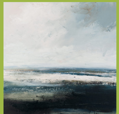
Above