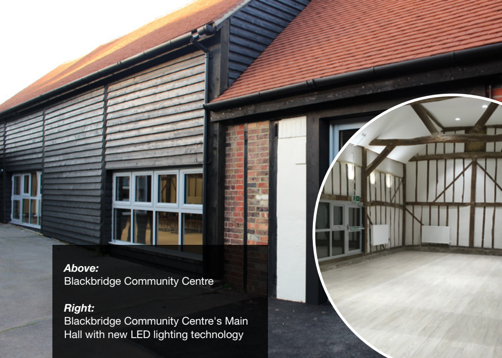
Above: Blackbridge Community Centre