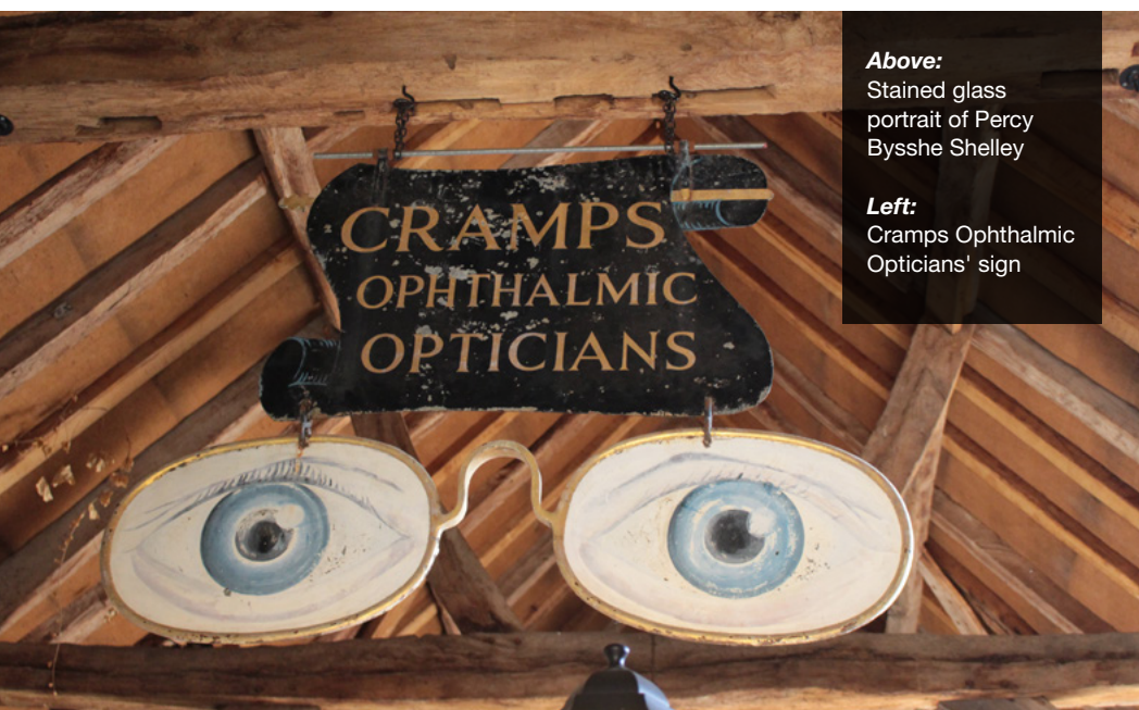
Below: Lightstream © 2022 Dion Salvador Lloyd