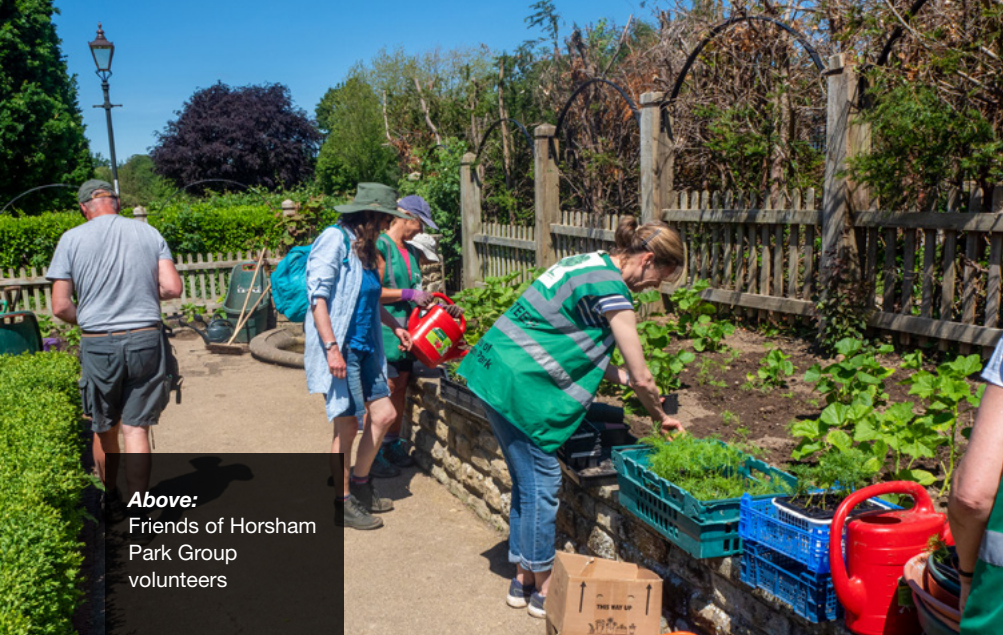
Above: Friends of Horsham Park Group volunteers