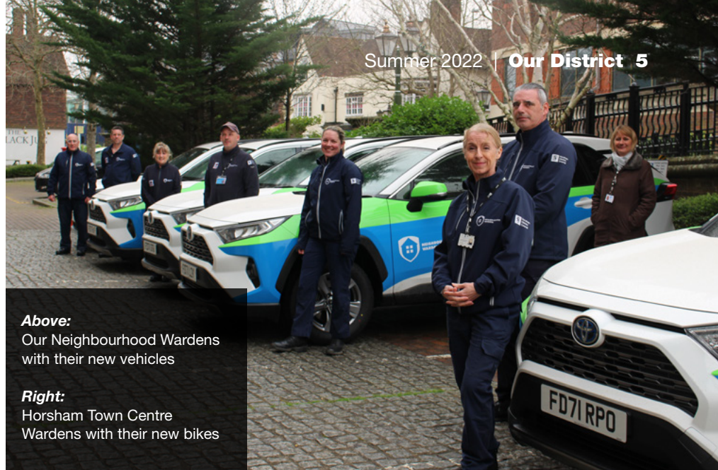
Above: Our Neighbourhood Wardens with their new vehicles

This new investment will support the Council's commitment to the environment and air quality