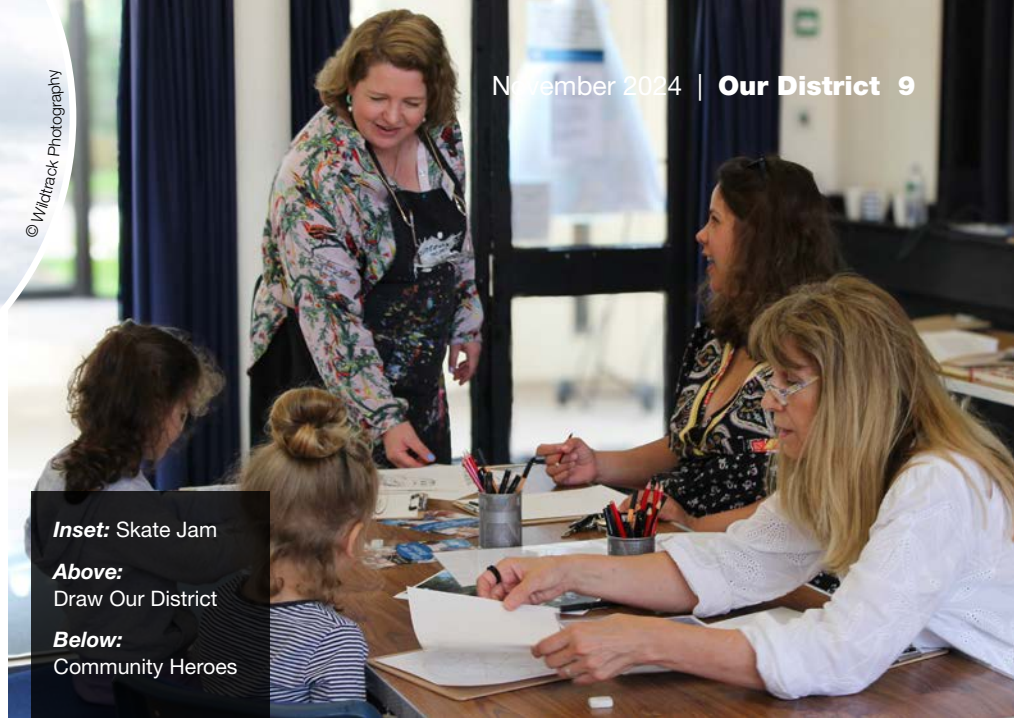
Inset: Skate Jam Above: Draw Our District Below: Community Heroes

We also held drop-in Draw Our District sessions, where lots of residents came together with the help of a mural artist to illustrate their favourite things about where they live. You can see a gallery of the artwork here: www.horsham.gov.uk/drawourdistrct .