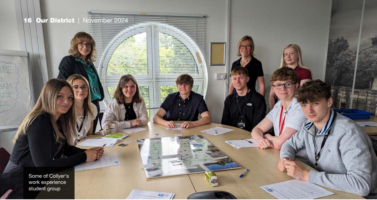
Some of Collyer's work experience student group