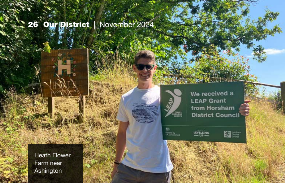
Heath Flower Farm near Ashington