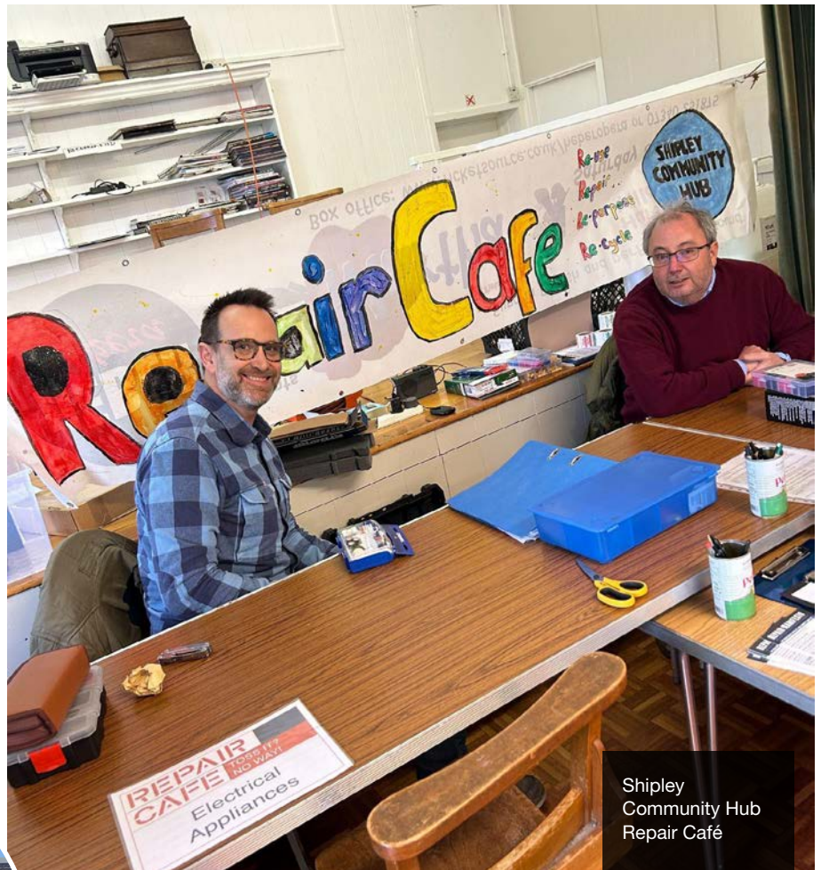
Shiple Community Hub Repair Café

The Springboard Project will be reducing their carbon dioxide emissions with 23 solar panels which will eventually cover up to 60% of their energy usage. This furthers the organisation's goal of limiting environmental impact for future generations as well as showing community leadership by switching to renewable energy and reducing their carbon footprint.